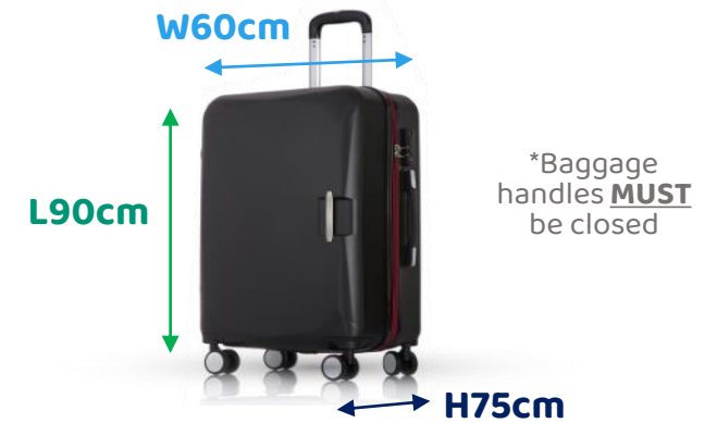
Baggage with at least one flat surface