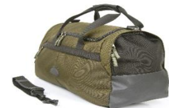
Regular shaped travel baggage